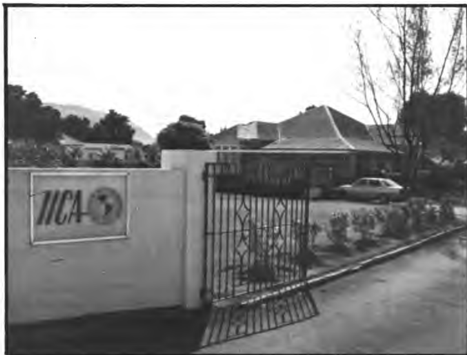
Inter-American Institute for Cooperation on Agriculture (IICA)