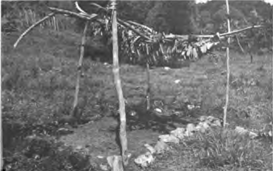
PREPARING YOUR NURSERY