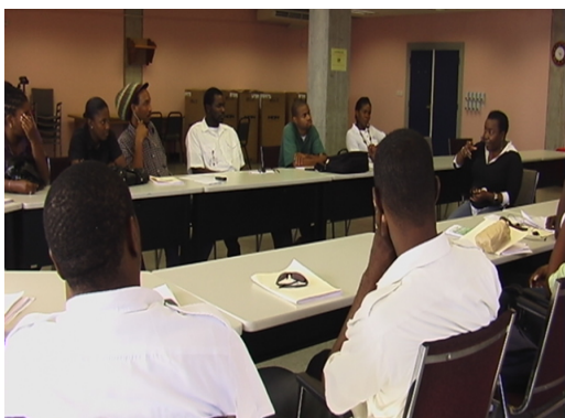
Inspectors' Training Workshop

Agricultural Health and Food Safety Specialist for the Caribbean Region and working jointly with the Plant Protection and Quarantine Unit of the Division of Agriculture sponsored and organized a Plant Quarantine Inspectors' training workshop from December 3-5, 2008. A total of 22 persons were trained. Participants were drawn from the Ministry of Agriculture (Plant Quarantine and Plant Protection Division, the Veterinary Division and the Extension Services), the Environmental Health Division of the Ministry of Health, the