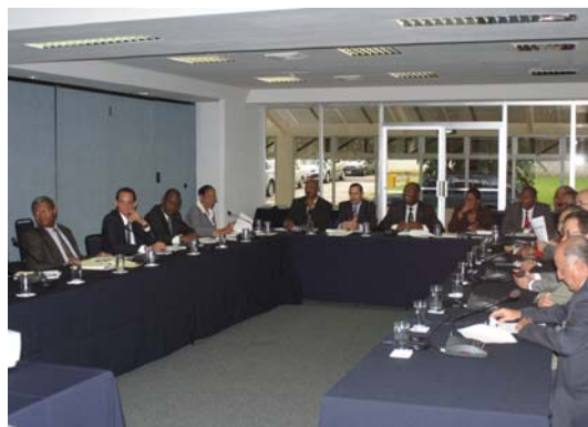
Workshop for New Leaders in Agriculture held in Costa Rica in July 2008

The IICA Office assisted the Minister of Agriculture, Fisheries and Forestry and the Permanent Secretary in their preparation for the IABA Meeting and the Forum for Leaders in Agriculture held in Costa Rica. Preparation included developing a position paper on the status of agriculture in Dominica as well as to