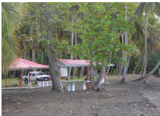
Recreational grounds developed at Macoucherie Shillingford Estate

Through an OAS-sponsored project, IICA coordinated and facilitated the attendance of a delegation of four persons to a Regional Investment Forum held in Barbados in February 2008. This