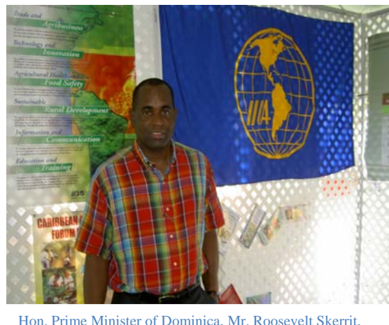
Hon. Prime Minister of Dominica, Mr. Roosevelt Skerrit, visiting IICA's Booth at the National Exhibition

IICA participated in the National Exhibition under the theme "New Realities for the Journey Ahead" during the 30 th Independence Anniversary celebration from October 28-November 1. This was a major event for Dominica as it showcased Dominica's products and services as part of the Reunion Celebration.