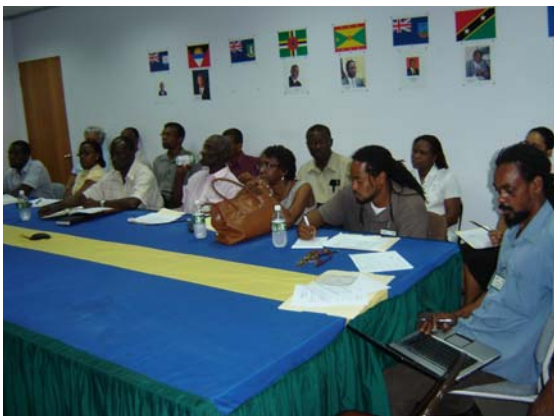
Participants at the 2-day Codex training workshop

IICA Office identified a suitable venue to allow twenty person representing critical agencies to attend the 2-day video-conferencing training workshop on June 18 & 19. Participants who attended the meeting came from Bureau of Standards, Dominica Chamber of Commerce, Dominica Chamber of Agribusiness, farmer organizations, Plant Quarantine, Veterinary Health, Division of Agriculture, National Codex Committee and the Ministry of Trade. The workshop was well received.