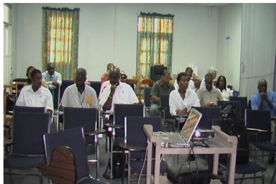
Participants at the 1-day OIE training workshop

IICA Office identified a suitable venue to allow fifteen persons representing critical agencies to attend the 1-day training workshop (via electronic forum)