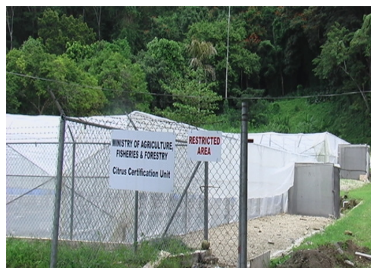
Ministry of Agriculture Citrus Nursery

oregmae for the effective control of Brown Citrus Aphids. Monthly surveys were undertaken to determine spread and distribution of the different strains of CTV island-wide as well as the implementation of a Citrus Certification Programme, citrus pest diagnosis, sampling and testing for CTV and other citrus pest to facilitate the restoration and to improve the long-term competitiveness, the long-term growth and viability of citrus.