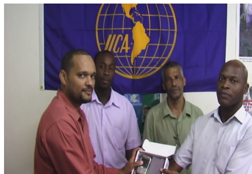
IICA Technical Specialist hands over a handset to the National VEPCoordinator while the CVO and Director of Agriculture look on.

The sponsors of the VEP programme are the United States Department of Agriculture, Animal and Plant Health Inspection Service (USDA/APHIS), CIRAD and IICA. In Dominica the priority diseases for surveillance are Avian Influenza, New Castle Disease and Brucellosis. There is also continued surveillance of Tropical Bont Tick (TBT).