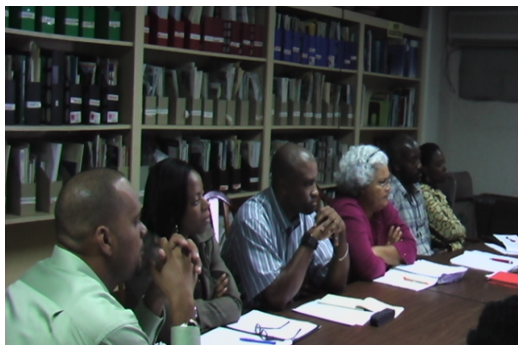
SPS Mentoring Workshop

IICA sponsored the participation of the Ministry of Agriculture official to the World Trade Organization's 43 rd meeting on Sanitary and Phytosanitary measures held in Geneva from October 6-9, 2008.