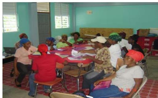
Training Workshop on agro-processing, labeling & packaging and food safety for Hilltop Plus Group in Paix Bouche

informal business named “Hilltop Fruit Plus” and developed a business plan to pursue their venture.