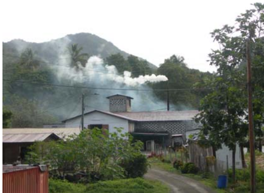
Macoucherie Estate- Rum Factory

Through an OAS-sponsored project, IICA coordinated and facilitated the attendance of a delegation of four persons to a Regional Investment Forum held in Barbados in February 2008. This