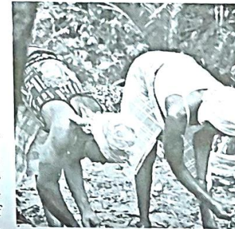
Women planting oerdi

This training programme has been organised to cover a six-month pe-