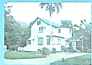
IICA OFFICE IN SURINAME Letitia Vriesdelaan 11 - Paramaribo

The national prizes will be presented on the 22nd of June in Paramaribo and the international prizes will be presented sometime after the 25th of July in San Jose - Costa Rica (Central America).