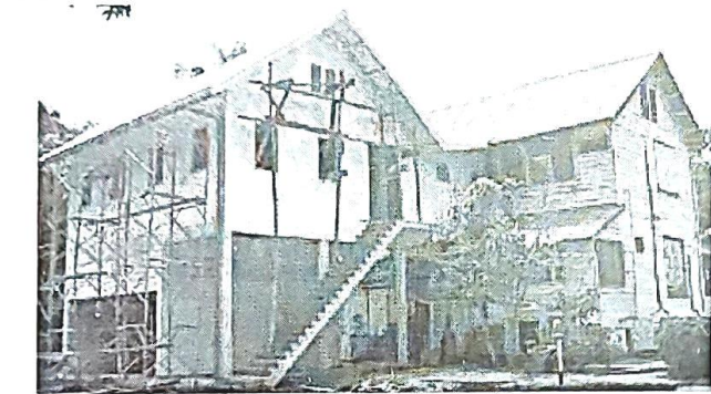
The Distance Learning Centre under construction, behind the IICA Office building at Letitia Vriesdelaan 11

These training courses will be accessible to all interested person for a reasonable fee for each course. But also scholarships will be available.