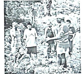
A group of farmers from Kwamalasemutu and Tepu on visit to LVV/IRD Project

This experience and exchange may present a structural way to facilitate