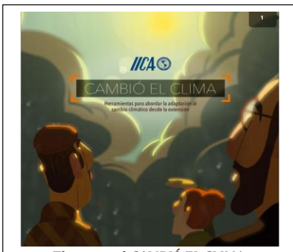
The manual CAMBIÓ EL CLIMA: herramientas para abordar la adaptación al cambio climático desde la extensión is available at www.iica.int.

In Argentina, Chile and Uruguay, research institutes, the ministries of agriculture and various family farmers' organizations are equipped with a conceptual framework related to the impact of climate change on family agriculture and a number of tools for the participatory design of strategies to adapt agriculture to those changes. An extension manual was also produced for that purpose. Under the project "Extension strategies: family farmers and their adaptation to climate change in selected territories of the Southern Cone," IICA and the Cooperative Program for the Technological Development of the Agri-food and Agro-industrial Sector of the Southern Cone (PROCISUR) imparted courses with the aim of preparing extension workers to train farmers in techniques for adapting agriculture to climate change.