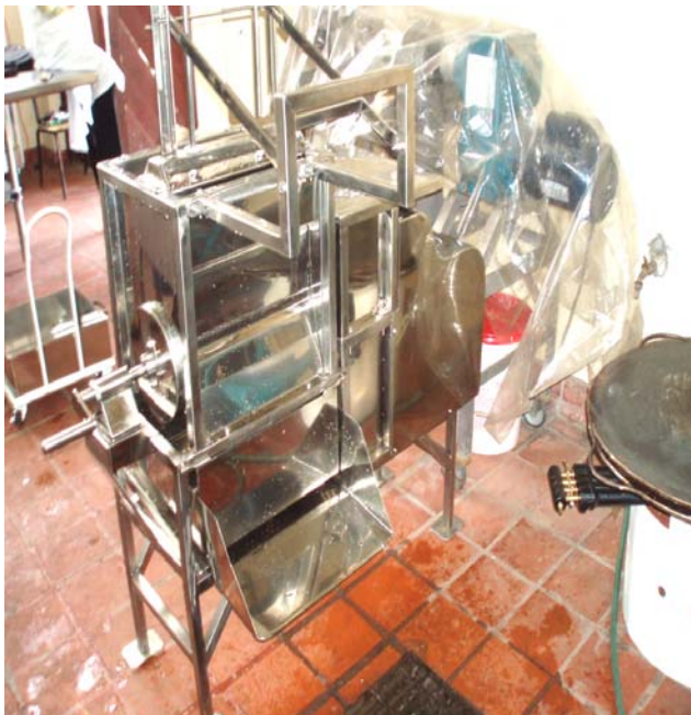
Display of some of the cassava processing equipment received

5.3.2 With the assistance of IICA, the Grenada Ministry of Agriculture, and the USAID, forty-five (45) rural women producers, members of Grenada Network of Rural Women Producers (GRENROP), have increased their potential to improve their living standards, through GRENROP's purchase and installation of cassava processing equipment. GRENROP could now look forward to establishing a vertically integrated cassava enterprise, with some members becoming involved in raw material production while others concentrate on the processing and marketing aspects, with all expected to benefit equally from the net proceeds of the enterprise activities. GRENROP also plans to provide a cassava grating service to small scale cassava processors whose current operations are manual in nature, and therefore very time consuming.