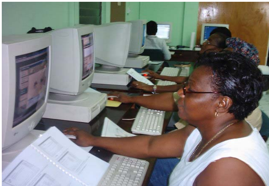
Participants receive hands-on training in Improved ICT Skills

Most were beneficiaries of a previous related workshop “Introduction to Computer Applications – Contributing to the Development of Agricultural Entrepreneurial Skills”, organized by IICA in 2004.