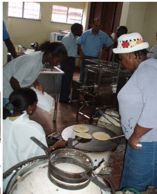
GRENROP members practise at making cassava by-products

In March 2005, GRENROP requested financial assistance from CARANA Corporation, through the United States Agency for International Development (USAID) Grenada Business and Agriculture Revitalization (GBAR) Programme, to purchase cassava processing equipment. The request was approved in May, and a grant of US$6792.00 (subsequently amended to US$7407.00) was made available to GRENROP which, according to the USAID/GRENROP Agreement, was expected to "contribute goods and services valued at approximately US$4259.00 ...", in a cost-sharing arrangement. GRENROP's share of the cost included import duty and tax which were waived by Government. Notwithstanding, GRENROP was still unable to meet the full amount of its contribution and therefore, through a written proposal, appealed to the Government of Grenada, through the Ministry of Agriculture (MoA), for financial assistance to help meet the full cost of the equipment. The requested funds (EC$4076.02, equivalent to US$1509.64), were approved by government, and made available through the MoA's Food Security Programme. GRENROP's direct monetary