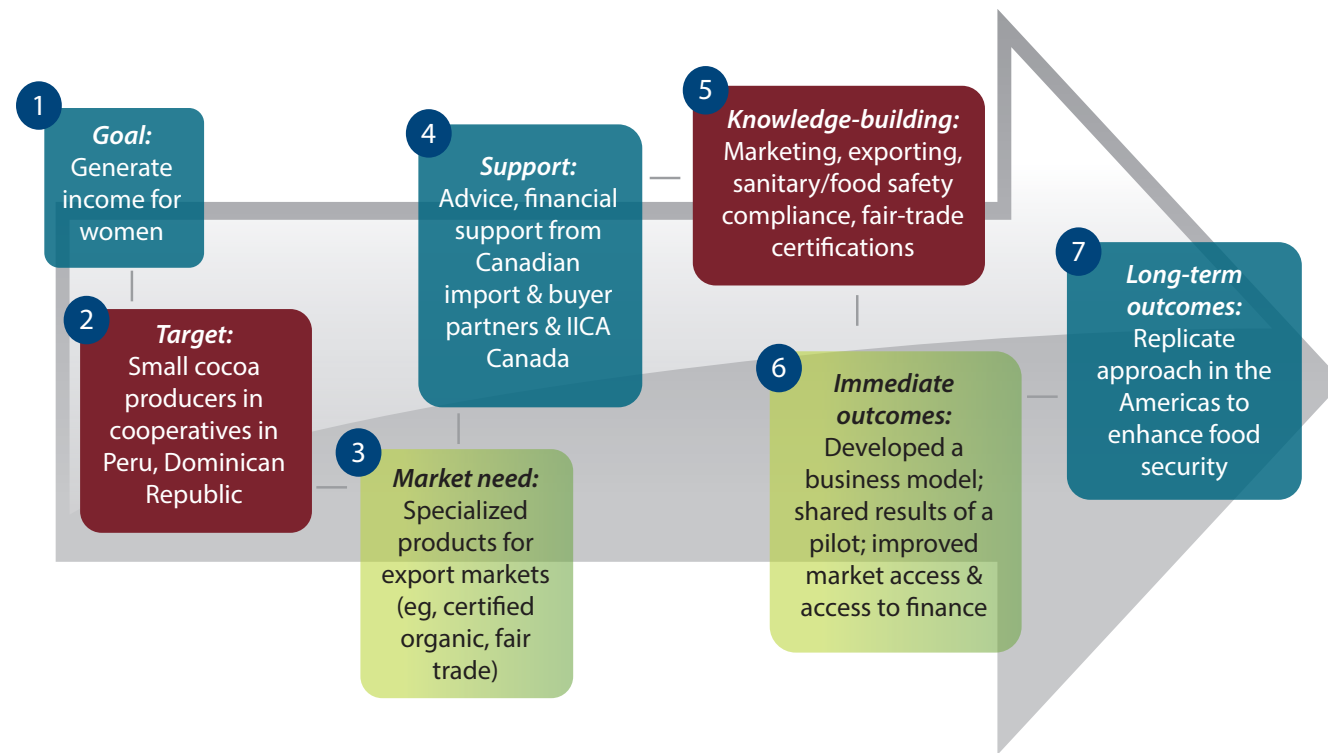
Diagram 2: A portrayal of how IICA Canada is enabling opportunities for small-scale women cacao producers